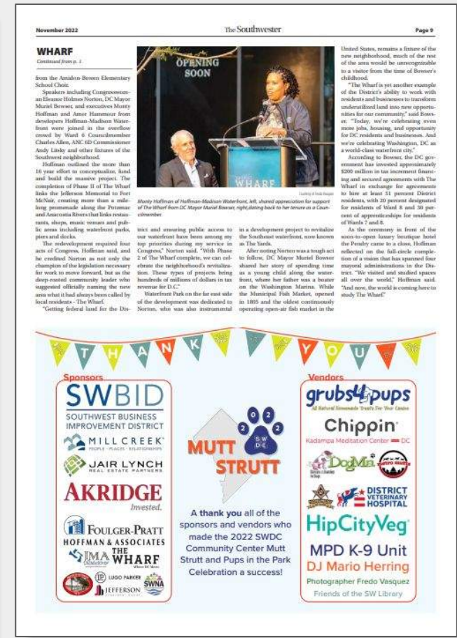
NOVEMBER 2022 HALF PAGE THANK YOU AD

EACH ISSUE OF THE SOUTHWESTER IS DISTRIBUTED TO 13,000 DIGITALLY AND 12,500 HARD COPIES ARE PRINTED.