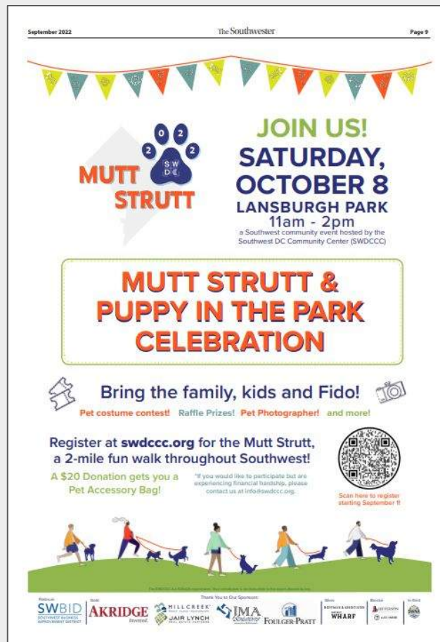
SEPTEMBER 2022 FULL PAGE AD