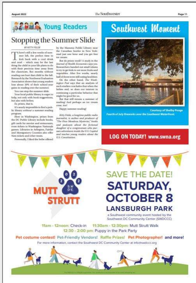
AUGUST 2022 HALF PAGE AD