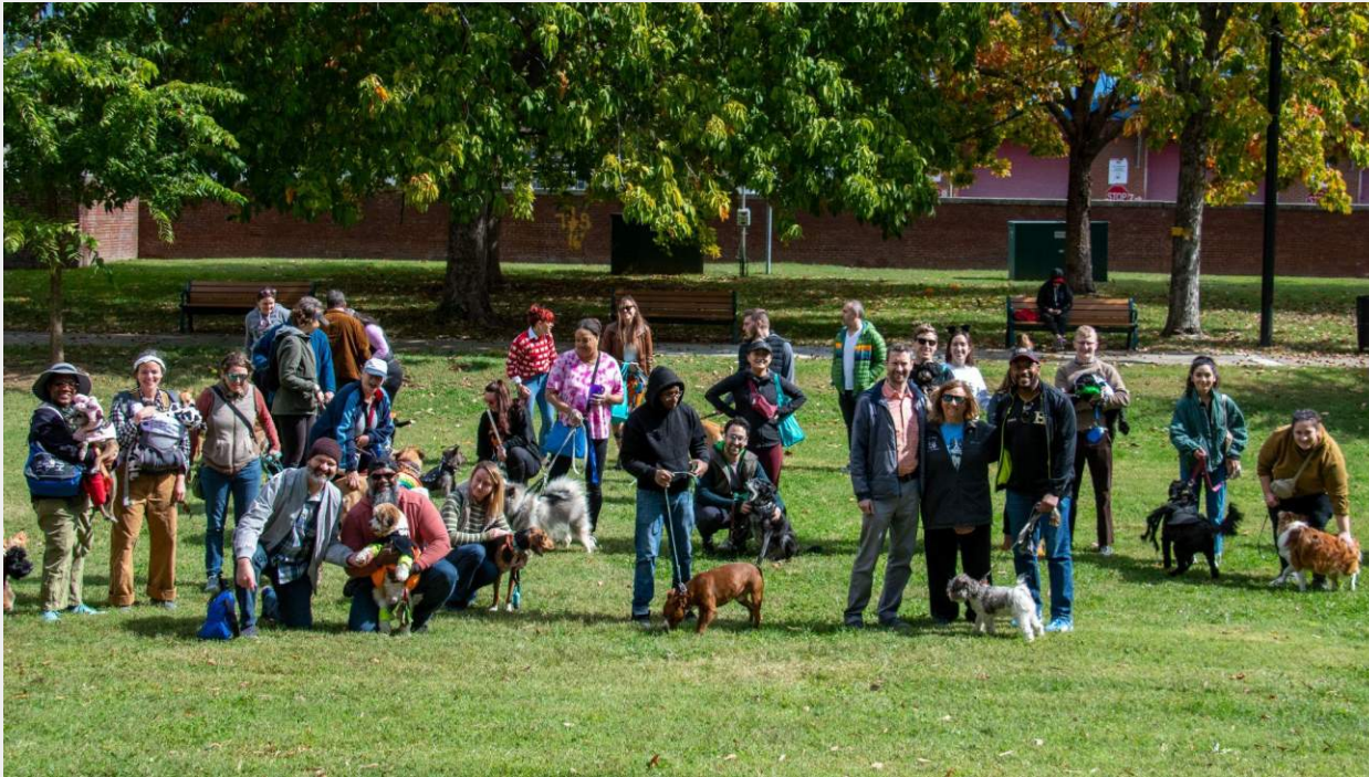
PET PHOTOGRAPHER TOOK PHOTOS OF THE EVENT AND PET PORTRAITS