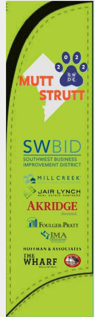
A FEATHER FLAG HIGHLIGHTING SPONSORS WAS FLOWN AT EACH OF THE THREE WATER STATIONS